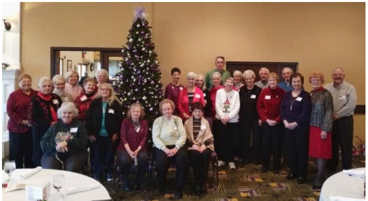
What a wonderful time we had at our Christmas Gathering at Lavender Crest. See you next year in 2023!