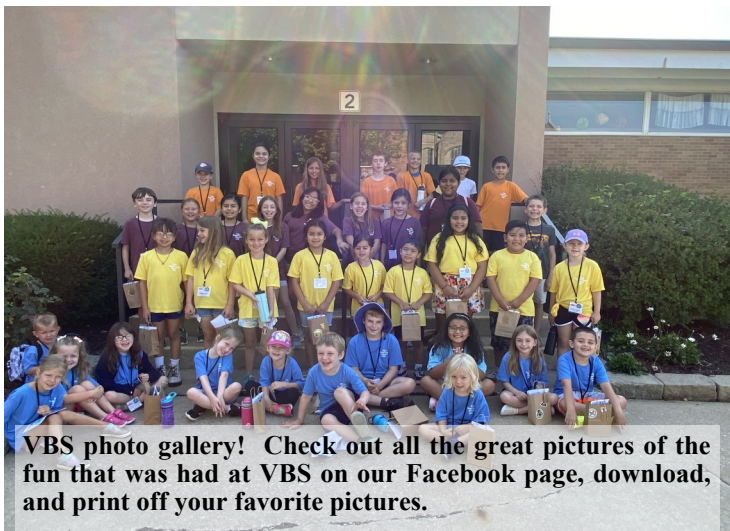
VBS photo gallery! Check out all the great pictures of the fun that was had at VBS on our Facebook page, download, and print off your favorite pictures.